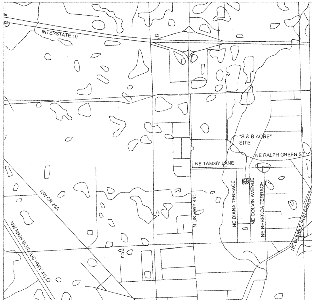
LOCATION MAP FROM 7.5 MINUTE SERIES QUADRANGLE MAP. SCALE 1" = 2000'

BEING A PART OF THE SOUTH 1/2 OF SECTION 17, TOWNSHIP 3 SOUTH, RANGE 17 EAST, COLUMBIA COUNTY, FLORIDA. AND BEING A REPLAT OF LOT 27 OF "FIVE POINTS ACRES", A SUBDIVISION AS PER PLAT THEREOF RECORDED IN PLAT BOOK 4, PAGE 22, OF THE PUBLIC RECORDS OF COLUMBIA COUNTY, FLORIDA.